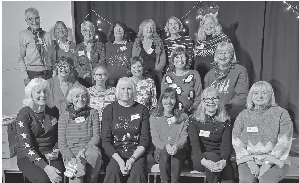
High Littleton & Hallatrow WI Christmas party