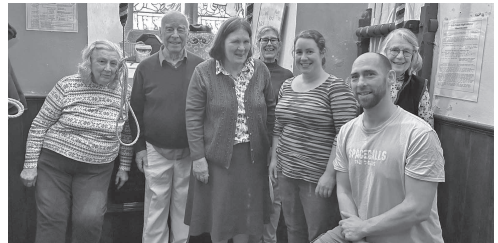
VE Day ringing by High Littleton and Paulton ringers.