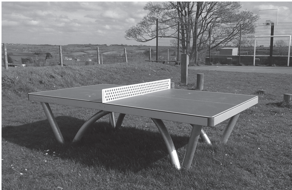
Fancy a game of table tennis?.....why not have a go at the new table at the Rec installed by the Rec Ground Trust.