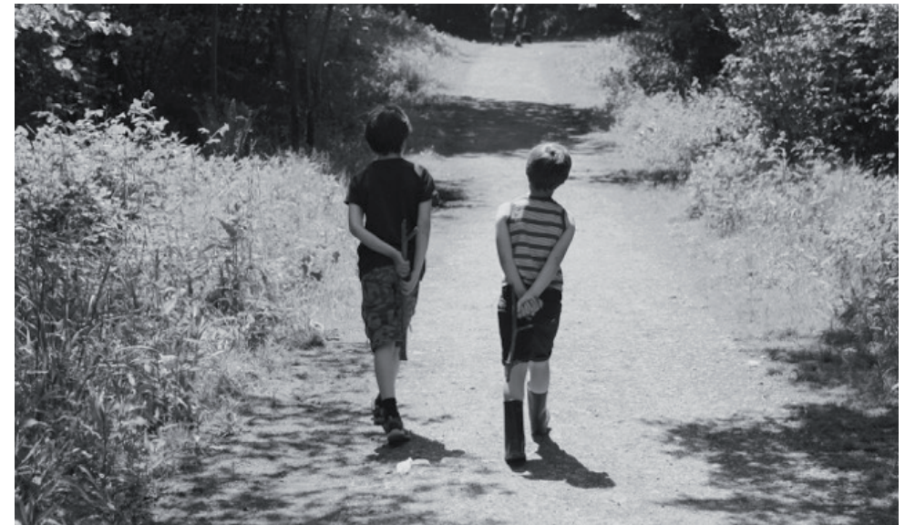
Make the most of the wonderful walks in Greyfield Wood - look out for the bluebells!